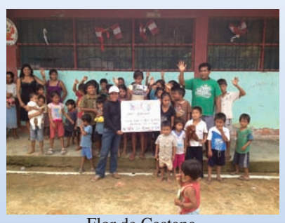
Flor de Castana thanks Labels, Inc./ FlexPrint